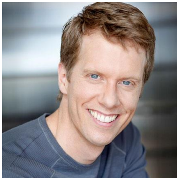
David Dickinson The One Man