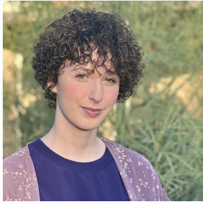
Narrator/ Beatrix Understudy