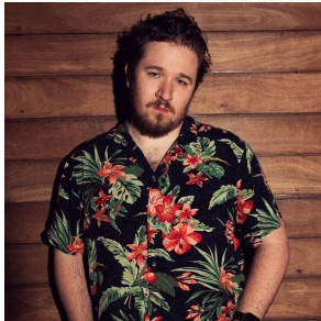
Director/ Artistic Director