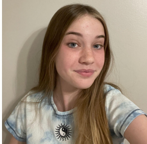
Ensemble/ Carmen Understudy