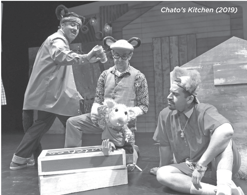
Chato's Kitchen (2019)