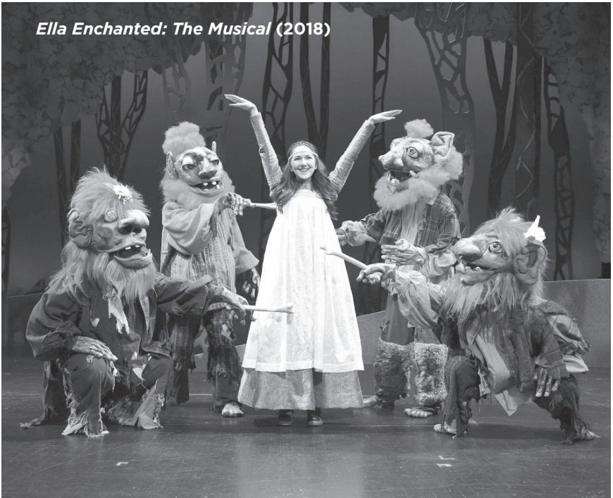
Ella Enchanted: The Musical (2018)