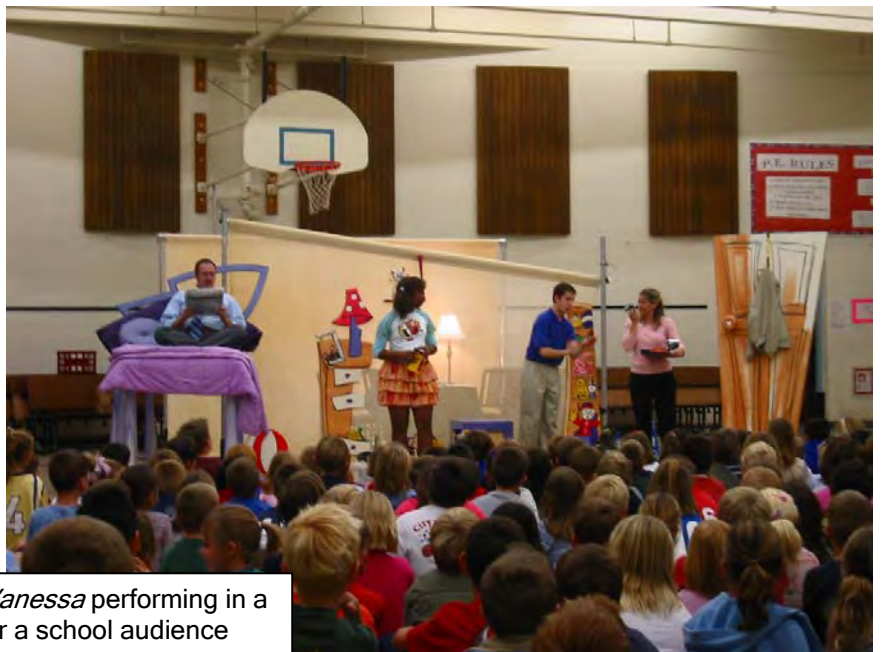
The cast of Interrupting Vanessa performing in a multi-purpose room for a school audience